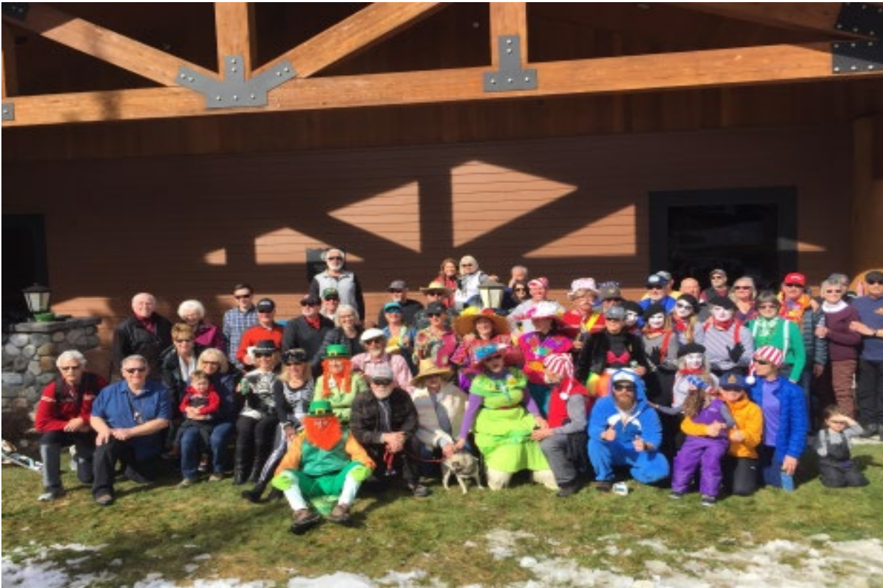
2018 Bier Slalom at Bend Oregon

Sending holiday greetings and wishes for a great Christmas season!